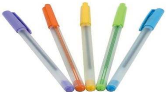
Single-time use (Use & throw) pens.