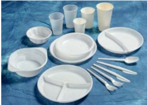
One time use/single use disposable items made of Thermocol (Polystyrene)/Plastic. e.g. dish, spoon, cups, plates, glasses, fork, bowl, container.