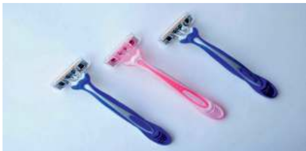
Single-time use (Use & throw) razors.