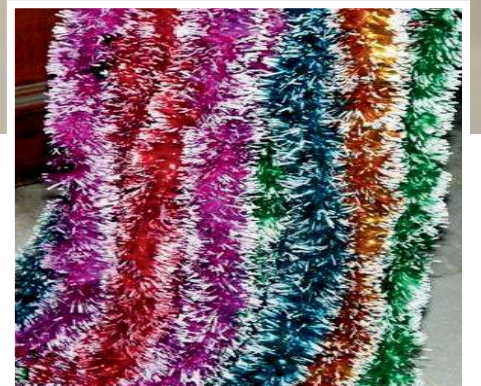
Use of Plastic & Thermocol for decoration purpose