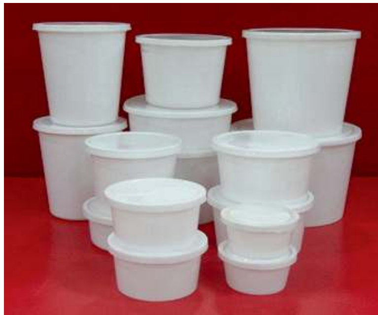
Disposable dish or bowl used for packaging of food in hotels.