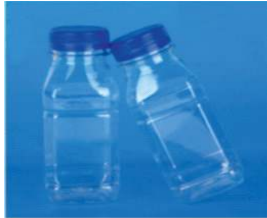
Less than 200 ml Drinking water PET/PETE bottles, having liquid holding capacity.