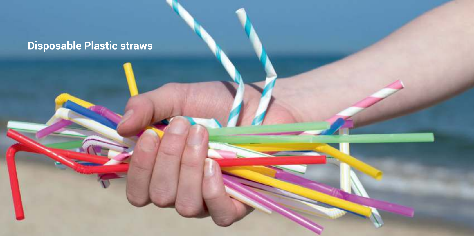
Disposable Plastic straws