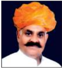
Shri. V.P. Singh Badnore Administrator of U.T. Chandigarh

“City Beautiful should say 'NO' to Plastic.”