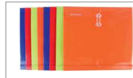
Plastic stationery products used for office & education